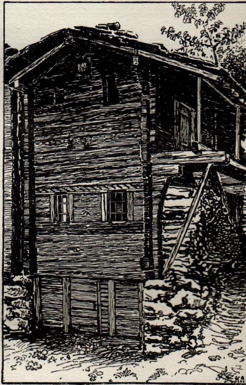
Das älteste Haus in Löttschen. „Das Hennähuis.“